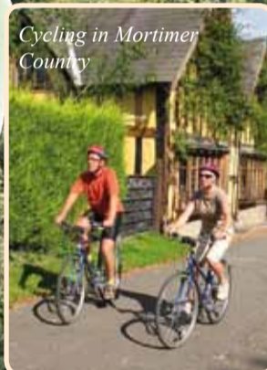
Cycling in Mortimer Country