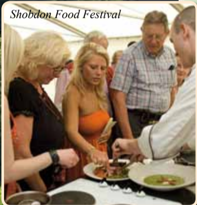
Shobdon Food Festival